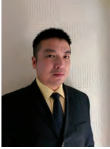
by Parker Yang CSIL International Market Research